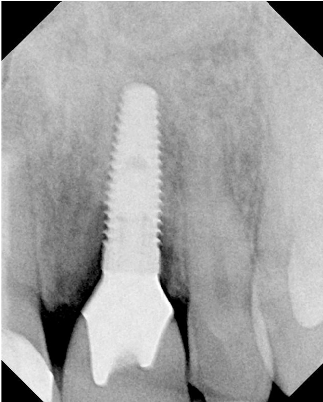
FIGURE 5 Case 3. Preoperative, standard periapical radiograph.

After LANAP, probings were within normal limits with no evidence of ongoing periodontal pathology (Fig. 6). Clinical photographs were not available.