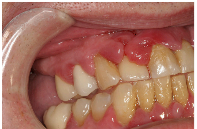
FIGURE 7 Case 4. Preoperative clinical appearance (ISB).

the presence of a pacemaker. Significantly, he was taking warfarin. †† His medical history and drug regimen were clearly contributory to the observed symptoms of generalized severe, progressive periodontal disease.