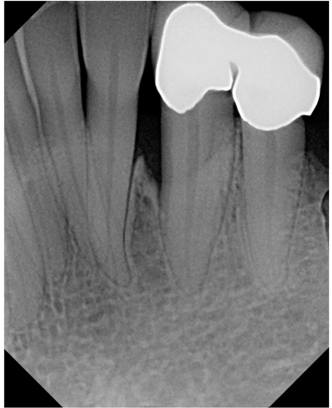
FIGURE 2 Case 1. Postoperative, standard radiograph at 10 months.

A 30-year-old male presented to a private practice (Dr. Braden Seamons, Honolulu, Hawaii) with an implant replacing tooth