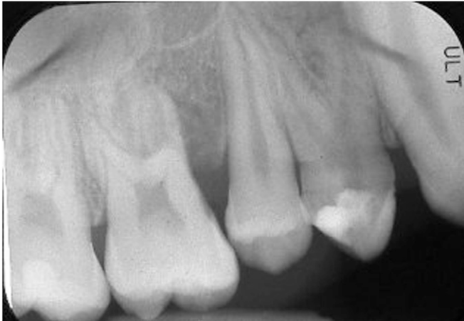
FIGURE 13 Case 5. Standard radiograph at 4 months.