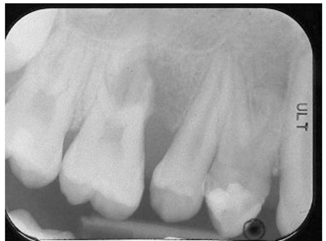
FIGURE 12 Case 5. Initial standard periapical radiograph at presentation showing severe AL and invasion of the trifurcation.

Plaque control was supplemented by twice-daily chlorhexidine rinse. At 1 month, the patient reported a marked reduction in blood glucose levels.