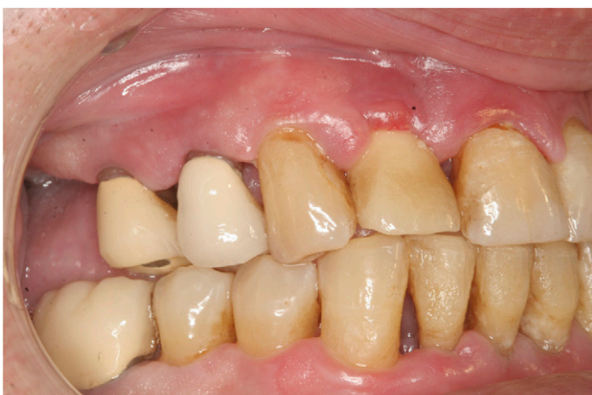
FIGURE 10 Case 4. Three-week healing. Note ongoing positive changes in gingival color and architecture, with minimal shrinkage and root exposure (ISB).

were discussed with the patient, and it was decided to provide LANAP (Fig. 8).