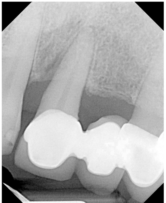
FIGURE 16 Case 6. Seven-month post-treatment standard radiograph exhibiting marked resolution of the osseous defect.