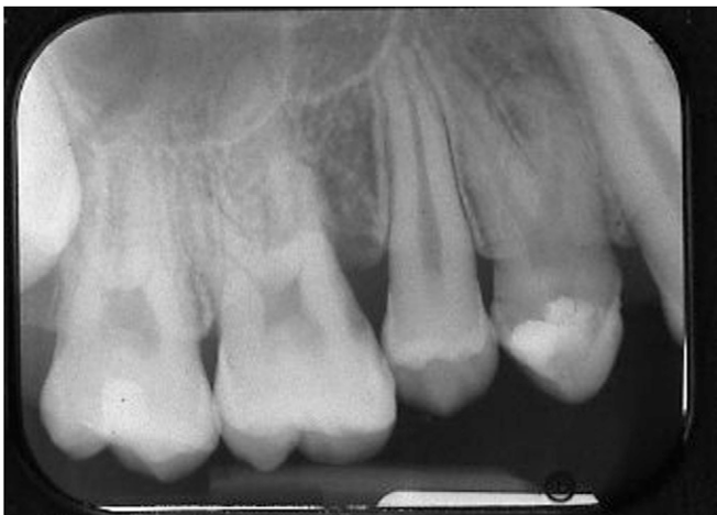
FIGURE 14 Case 5. Standard radiograph at 11 months.

alternative treatments, and possible consequences of non-treatment were discussed with the patient, and it was decided to provide LANAP.