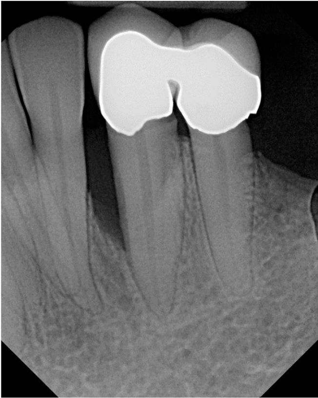
FIGURE 1 Case 1. Preoperative, standard clinical periapical radiograph.

Sequential standard radiographs during the postoperative period illustrated evidence of progressive repair and suggested ongoing regeneration (Fig. 2). Probing was within normal limits, without observable pathology, and the diastema had spontaneously closed. Clinical photographs were not available.