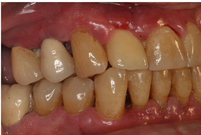
FIGURE 9 Case 4. Substantial healing and alteration of the gingival tissues at 1 week despite the presence of interproximal plaque deposition (ISB).