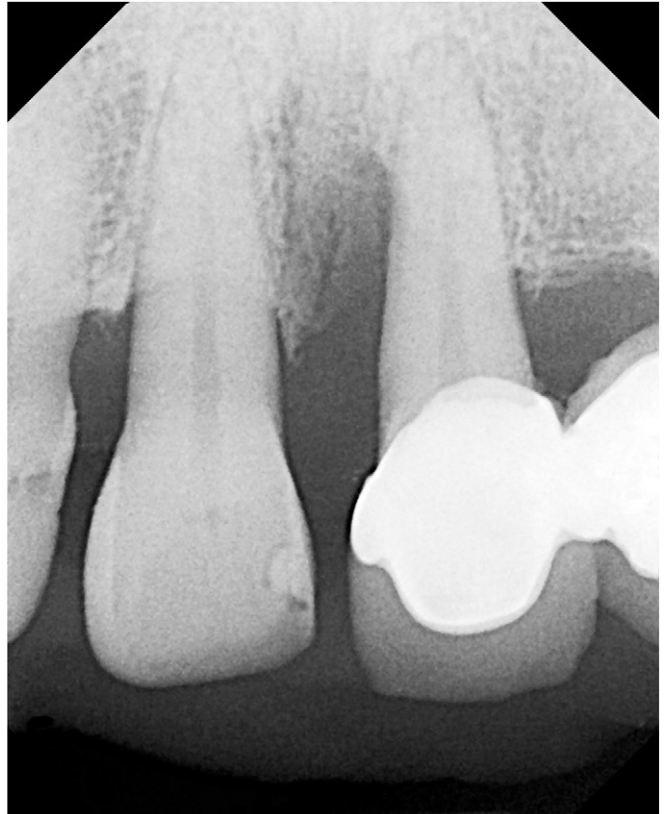
FIGURE 15 Case 6. Initial standard periapical radiograph illustrating the osseous defect.

Seven months after treatment, a marked resolution of the osseous defect was observed (Fig. 16). Clinical photographs were not available.