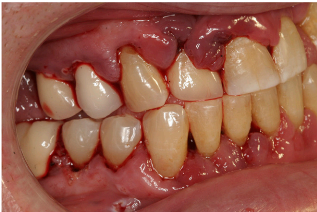
FIGURE 8 Case 4. Tissues immediately after surgery. Note the marked absence of bleeding. Early, generalized thermal fibrin clotting is exhibited at the gingival margins (ISB).