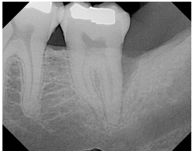
FIGURE 3 Case 2. Preoperative, standard periapical radiograph.

#9 that had been placed several years previously (Fig. 5). Pathologic loss of crestal bone was noted, with PDs of 6 mm on the mesial aspect and 5 mm on the distal aspect. Accurate measurements may have been greater, but the width of the probe precluded reaching the base of the defects. Medical history was unremarkable and non-contributory. The benefits, risks, alternative treatments and possible consequences of non-treatment were discussed with the patient, and it was decided to provide LANAP.