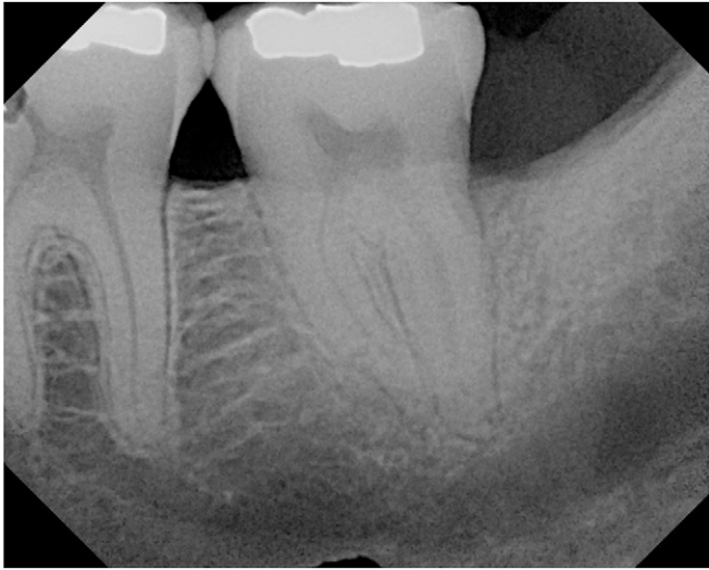
FIGURE 4 Case 2. Postoperative, standard radiograph at 15 months.